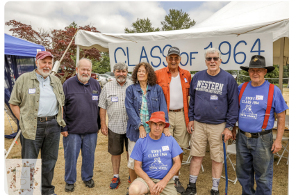
SWHS Class of 1964