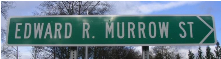
New street in Sedro-Woolley!